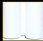
STANDARD KIT (SINGLE USE) FILTERS Part No. 200-1026