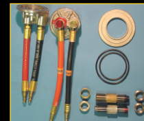
SPIN-ON ADAPTER KIT (STANDARD) Part No. 200-3112