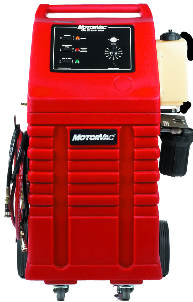
Part No. 500-6050